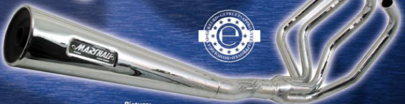
Picture: MARSHALL Deeptone 4 into 1 System