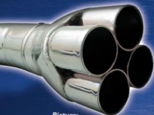
Picture: 4 into 1 Connection Joint